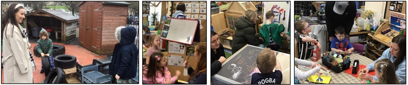
Elm Class enjoyed welcoming parents into class for their "Come and see how we learn" event on Friday.